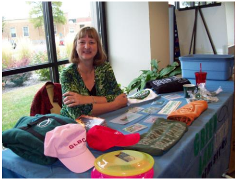
Green Lake Bible Cam