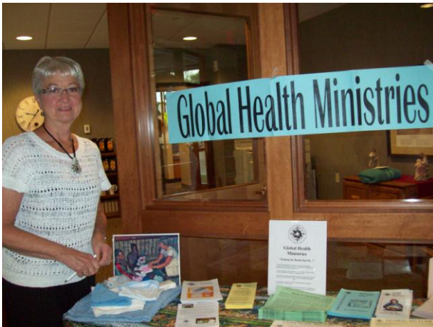
Global Health Ministries