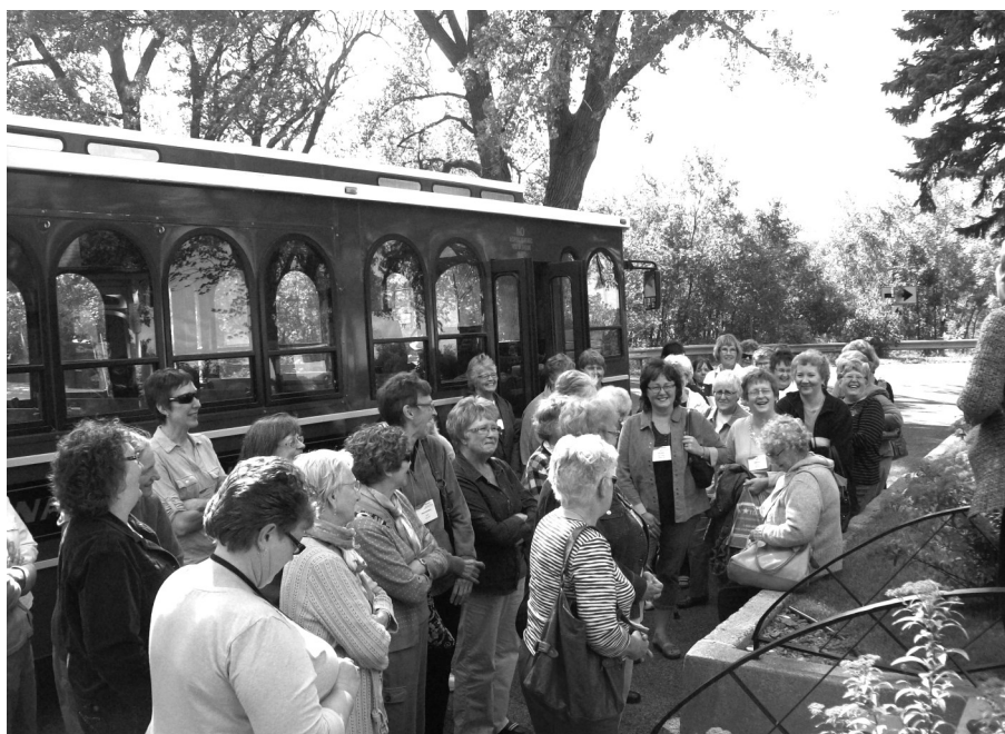
Getting of the trolley at the Mellette House.