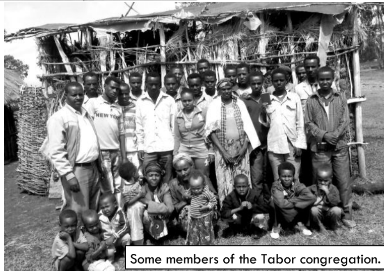
Some members of the Tabor congregation.

We are pleased to announce that between 11 and 14 people from Augustana District churches (from Wisconsin, Minnesota, and South Dakota) will be traveling to Hawassa this January 9-19, 2014. Their purpose is to further explore the possibilities of an active relationship with the Tabor congregation and its outreach and evangelistic ministries.