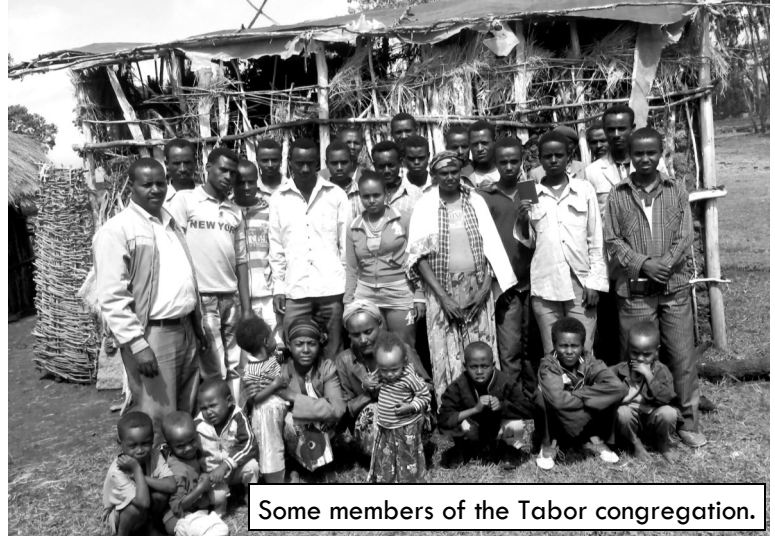
Some members of the Tabor congregation.

We are pleased to announce that between 11 and 14 people from Augustana District churches (from Wisconsin, Minnesota, and South Dakota) will be traveling to Hawassa this January 9-19, 2014. Their purpose is to further explore the possibilities of an active relationship with the Tabor congregation and its outreach and evangelistic ministries.