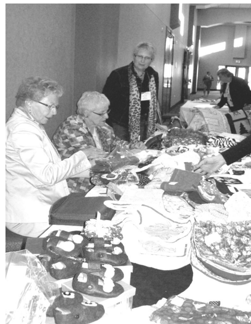
The WOW Boutique raised money for the Augustana District.

Watch for details in a newsletter coming to you soon!