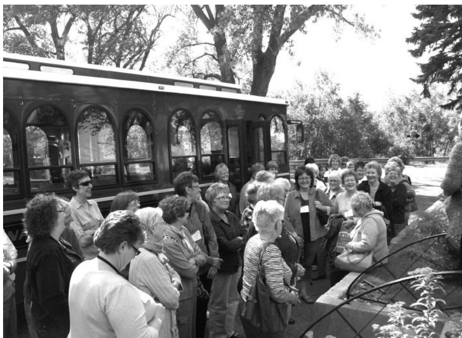
Getting of the trolley at the Mellette House.