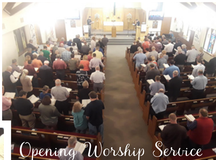
Opening Worship Service