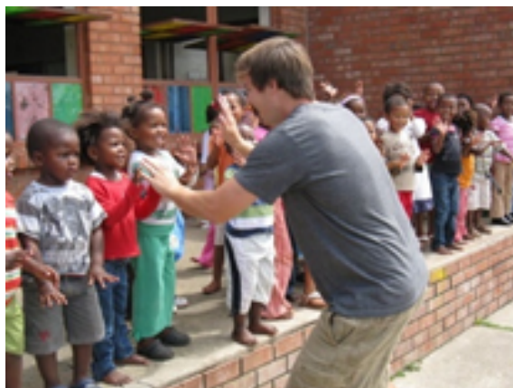
Serving at a Daycare Center in South Africa

adult who has been baptized is an ambassador of Christ's reconciliation. Notice in Paul's second letter to the Corinthians how universal the claims are.