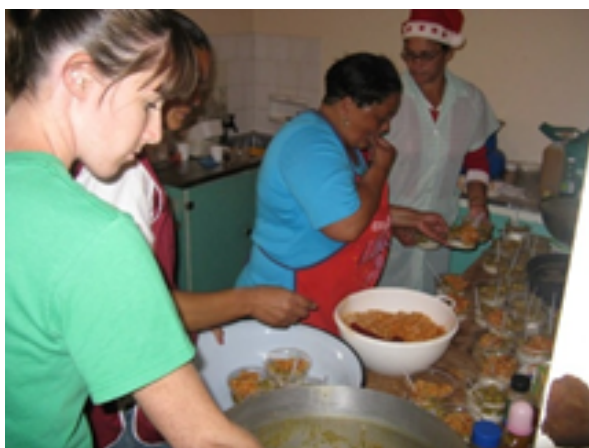
Serving at a South Africa Soup Kitchen

“[New life in Christ] is from God, who through Christ reconciled us to himself and gave us the ministry of reconciliation; that is, in Christ God was reconciling the world to himself, not counting their trespasses against them, and entrusting to us the message of reconciliation. Therefore, we are ambassadors for Christ, God making his appeal through us. (2 Cor. 5:18-20a)