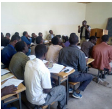
Regional Evangelist Training