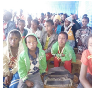
New Church Building at Beseko Ilala