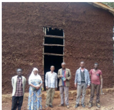
New Church Building at Goljota