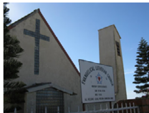
The ELCSA church in Gelvandale, PE. The soup kitchen was in the social hall behind the tower on the right.

I am now a pastor in central Illinois and serve on the Augustana District Board of World Missions. But I have also been working with one of our vetted Augustana District Missions organizations and LCMC mission partner organization called Awakening Lives to World Missions (ALWM.org). Together we have been developing a Young Adult Missionary Internship (YAMI) to give young people an in-depth experience of cross-cultural