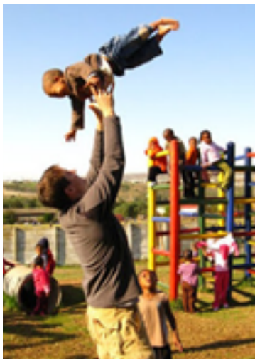
Playing with the kids was my regular workout!

Our time in South Africa flew by. We made incredible friendships and learned a lot about the world, ourselves, and God's church. However, there is nothing like this for young adults in LCMC or NALC churches.