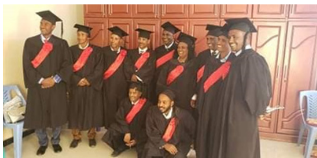
2019 Graduating Class