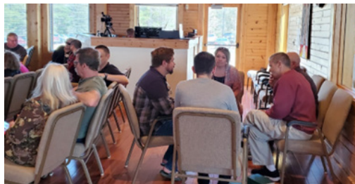
Small group discussion time.