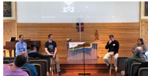
Q & A Panel discussion

The Augustana District Council and the Board of Theology and Ministry decided to take a new approach with their annual gatherings this year. The annual Convocation of the Cross (theological conference) and Annual Convention were scheduled together (May 6-7) at Mt. Carmel Ministries, in Alexandria, MN.