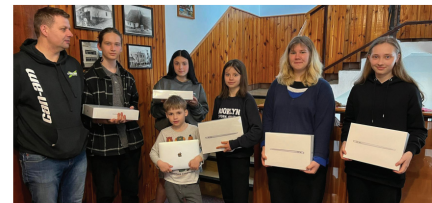
Ukrainian students with new laptops from SOLA. For the story behind the photo, see pages 1 and 12.