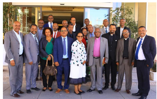
Augustana District Ethiopia Partners Working with Each Other